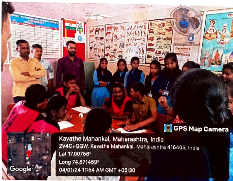
Community Engagement Program